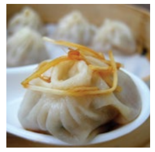
Plenty of great food to discover